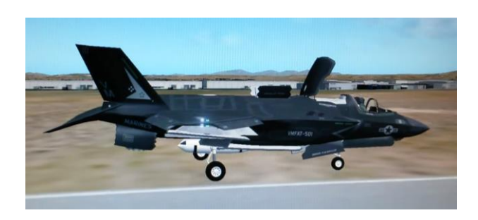
X-Plane F-35 Figure 2