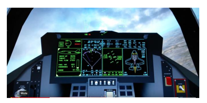
X-Plane F-35 Cockpit Figure 3