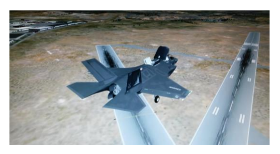
X-Plane F-35 Figure 1

Test team members unfamiliar with aircraft can gain needed experience learning the basics of flight with Technically Speaking Instructors and using an X-Plane simulator similar to Figure 4.